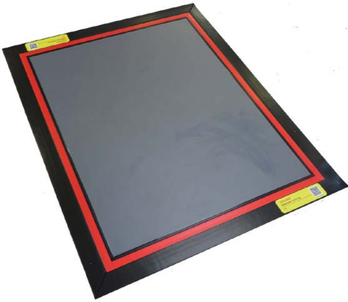
EXAMPLE OF THE FLOATING FLOOR MAT